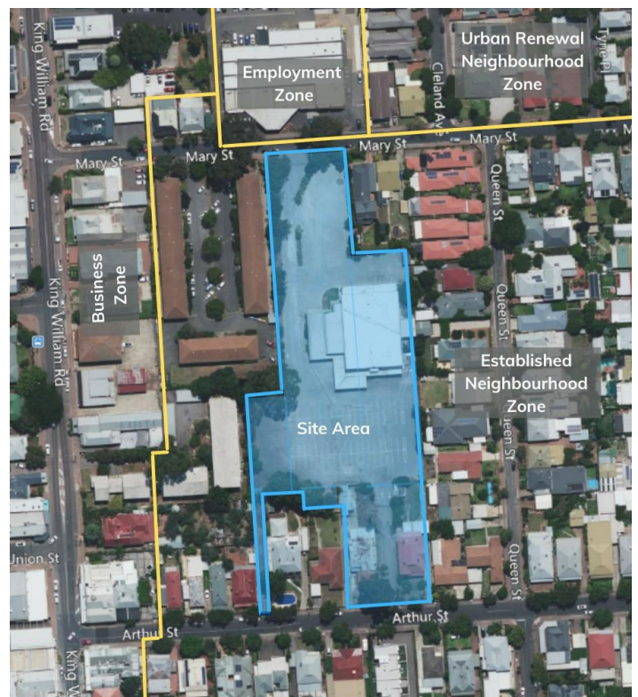
Figure 1: Site Area and Zones

The Code Amendment includes a range of allied studies that investigate the key issues associated with the rezoning. We are seeking your feedback on these studies and the Code Amendment.